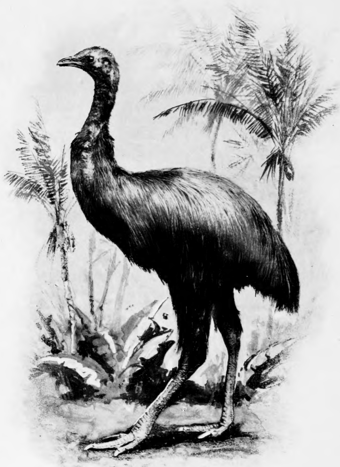
CASUARIUS UNIAPPENDICULATUS, juv.